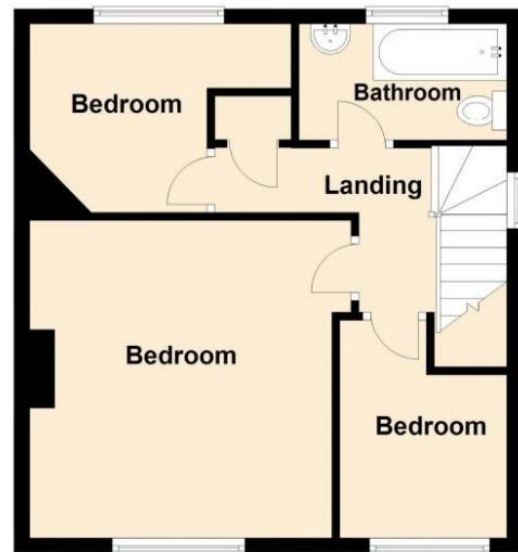
First Floor Approx. 38.8 sq. metres (418.1 sq. feet)

Total area: approx. 77.2 sq. metres (830.7 sq. feet)